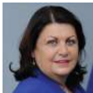
Máire Geoghegan Quinn, EC Commissioner for Research and Innovation

"Over the last 30 years there has been a remarkable rise in women's level of education and participation in the labour market, including research. Europe represents one of the largest producers and markets for science knowledge, but it needs to be made more inclusive and "innovation-friendly" through user-driven innovations that target societal challenges such as health, aging population and energy . Healthy population is a goal common to all European countries, and a challenge that offers considerable potential for Europe to lead the world in providing innovative responses. But, it is also an area where for many years research has turned a blind eye to the role of sex and gender differences in disease prevalence, progress and clinical outcomes, and where innovation cultures have not seen women as 'owners' of problems worthy of special attention. Correcting such inequalities is important to quality of research but also to create opportunities for new discoveries in areas such as biomarkers, stem cells and cancer diagnostics. The multi-stakeholder dialogue promoted by the Gender Summit will help redefine the research and innovation landscape to give women and men an equal role in research and society, as co-owners and co-solvers of Europe's societal challenges."