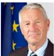
Mr Thorbjørn Jagland, Secretary General of the Council of Europe

"We need to be smarter, sharper and more focused in our research and innovation missions by concentrating on a small number of 'big ticket' items, which are crucial for achieving impact on the economy and society. They include fair, transparent, merit based recruitment, and specific measures to support women's scientific careers and their active engagement in innovation. The Gender Summit will review available evidence and experience of how to enhance quality of science knowledge making, and help create new markets for scientific knowledge , by addressing gender issues in research and innovation. I very much look forward to hearing the outcome of these discussions, which will provide useful input and help us identify realistic opportunities for implementing gender equality measures within HORIZON 2020, Innovation Union and ERA. "